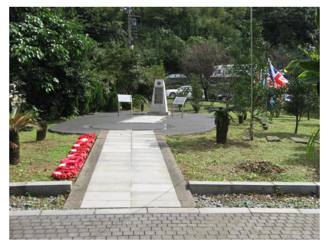
Sunshine on Remembrance Day at Kinkaseki