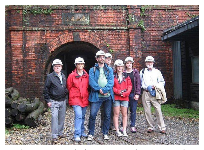
Our guests outside the entrance to the mine tunnel.

On Thursday November 7<sup>th</sup> we began our week's activities with a day trip to Jinguashi to visit the Gold Ecological Park with its mining museum and tunnel, and the site of the former Kinkaseki POW Camp and the mine area where the POWs worked. On the return trip to Taipei we stopped at the port of Keelung to visit the docks where the POWs who first came into Kinkaseki and Taihoku Camp 6 landed, and from where all of the POWs left on the island at the end of the war were evacuated.