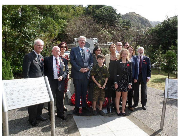
POW Family members with the Magee family