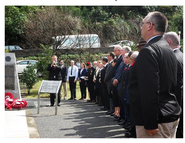
Last Post played at the Remembrance Day Service