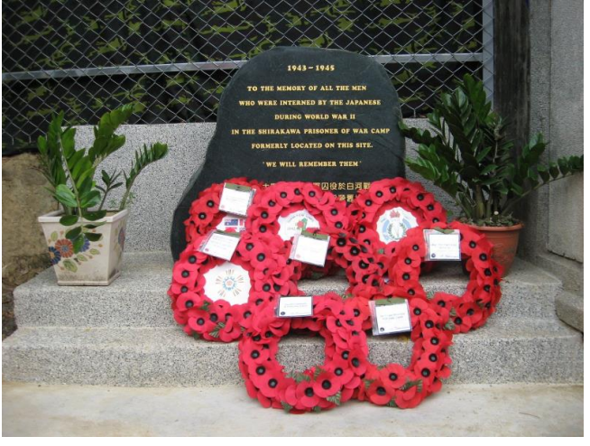
The Shirakawa POW Memorial